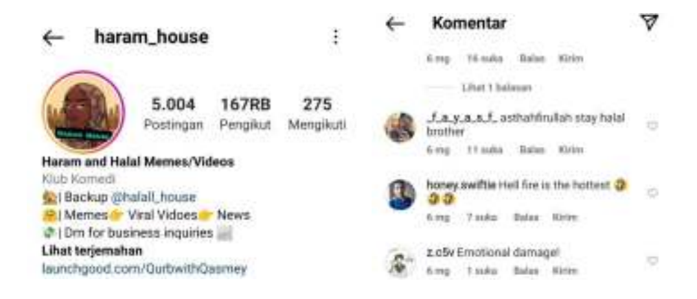
Figure 8 (left) The haram_house account Figure 9 (right) Comments from haram_house followers

Some comments indicate that the memes reminded followers to do good deeds and avoid bad deeds. As figure 10 shows, one meme displays that a Muslim should run away from things on the internet and social media which are prohibited ( harām ) in Islam. This meme clearly contains da 'wah values and can have an impact on followers.