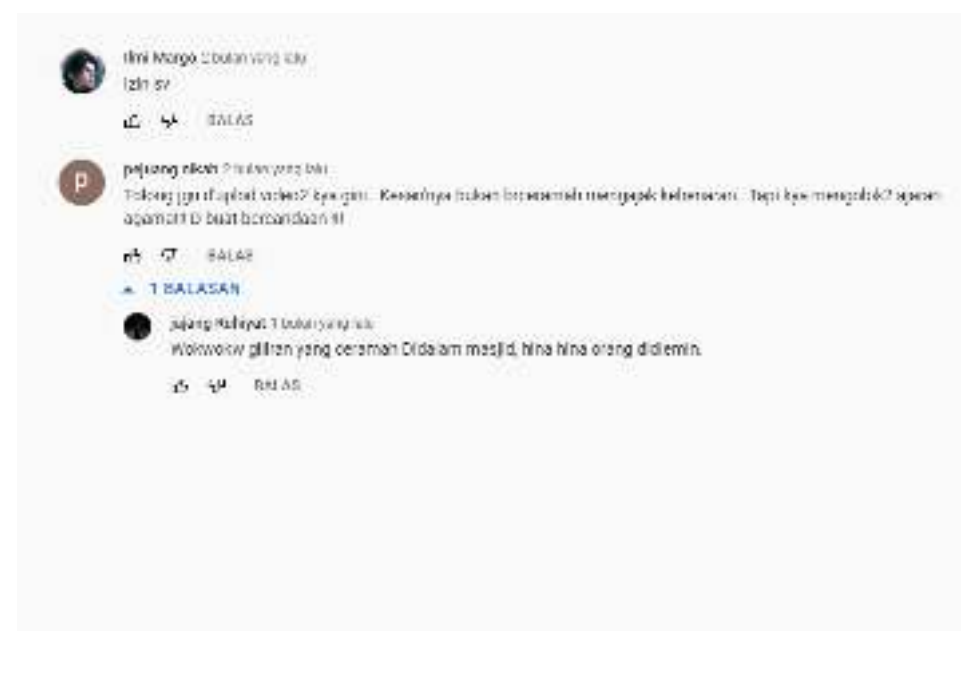
Figure 1 Viewers response toward a Kuliah Antum video by Dzawin Nur. The comment shows that the viewer does not like the content because they think that this content discredits religious tenets.

of Islam or the Muslim experience is sometimes based on problematic assumptions around Muslim history and social life.