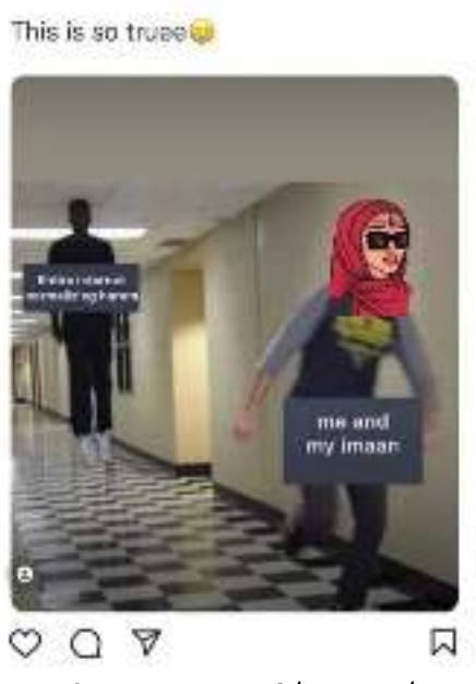
Figure 10 A meme on @haram_house

Some comments indicate that the memes reminded followers to do good deeds and avoid bad deeds. As figure 10 shows, one meme displays that a Muslim should run away from things on the internet and social media which are prohibited ( harām ) in Islam. This meme clearly contains da 'wah values and can have an impact on followers.