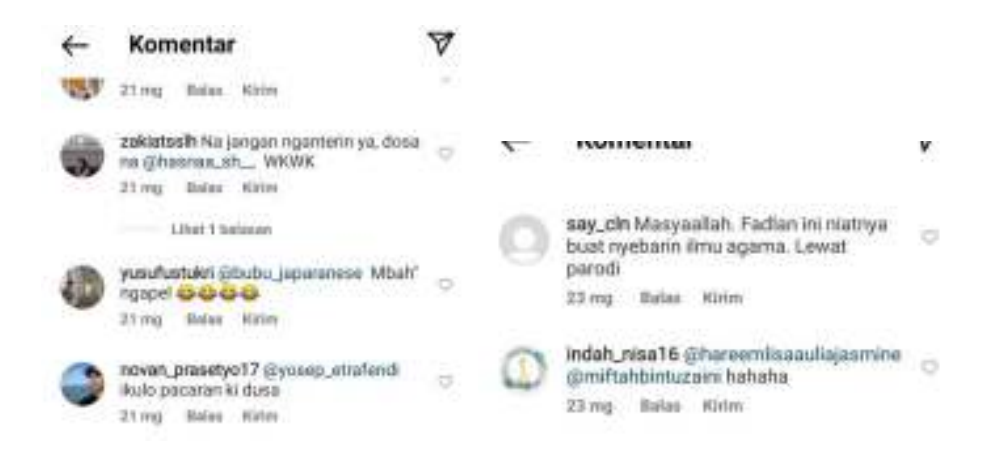
Figure 6 (left) The comments of viewers show that they are Fadlan as aware that dating (khalwat) is sinful; Figure 7 (right) This comment shows support for a preacher.