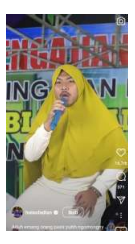
Figure 5 Fadlan conducted the parody of Mama Dedeh

account. This shows that viewers are more inclusive regarding gender and perhaps care about the content only.